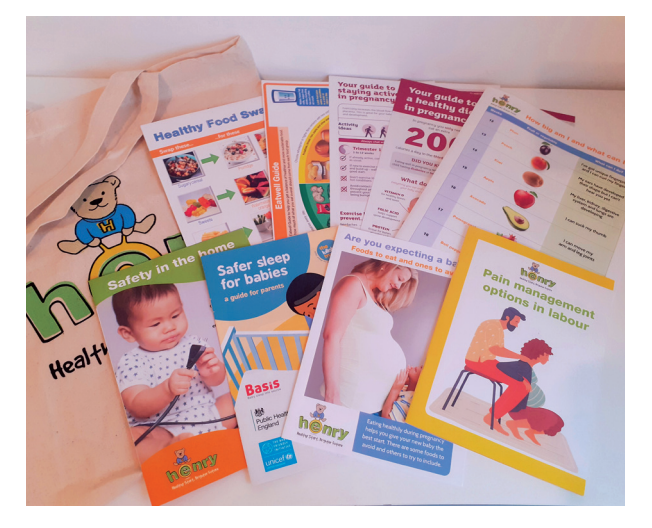
The Preparation for Parenthood family resource set free to everyone joining the programme

Everyone joining the Preparation for Parenthood programme receives a set of family resources which includes everything you'll need during the programme and helpful material to use during your pregnancy and beyond.